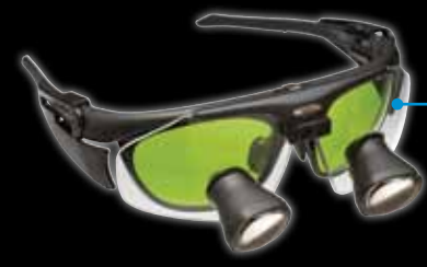
LASER PROTECTION & MAGNIFICATION