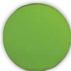
800-830 nm 940-980 nm 1064 nm 10,600 nm